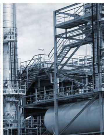
CONSTRUCTION & ASSEMBLY